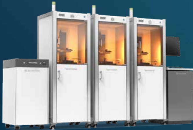
Figure 4 3D printing is ideal for when you require high-speed, high-volume 3D printing of smaller-sized production-grade clear parts. In addition to print speed, Figure 4 maximizes productivity with a short post-cure step that does not require thermal curing. You can also densely pack or nest parts into the build chamber in the most convenient orientation without sacrificing part isotropic properties.