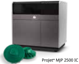
ProJet® MJP 2500 IC

Building productivity and new manufacturing efficiencies with tool-less 3D printed casting pattern production from 3D Systems