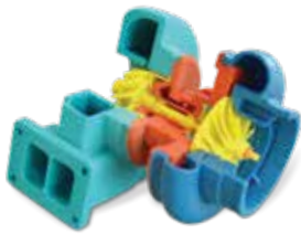
Turbocharger concept model, with each component color coded for easy identification

Closed-loop powder loading, removal, and recycling of natural products based build materials make it eco-friendly and safe to use. There are no physical support structures to remove with cutting tools or toxic chemicals.