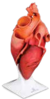
Complex models, like this heart, can be printed with gradients on 3D Systems CJP printers