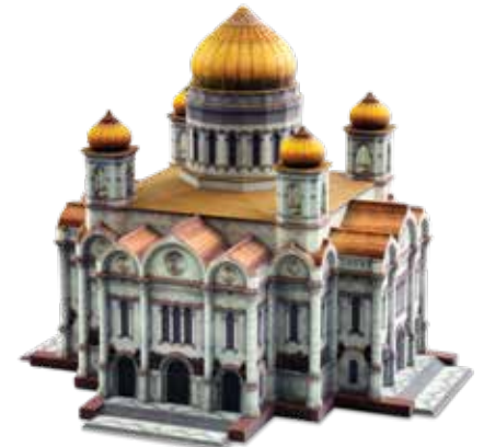
Large-scale architectural models can be printed in one piece

COMPACT TO GENEROUS BUILD VOLUMES - Access full color 3D printing with the affordable and compact ProJet CJP 260Plus printer, up to the large capacity ProJet CJP 860Pro with a build volume of 20 x 15 x 9 inches (508 x 381 x 229 mm) to create very large models or high volumes of prototypes.