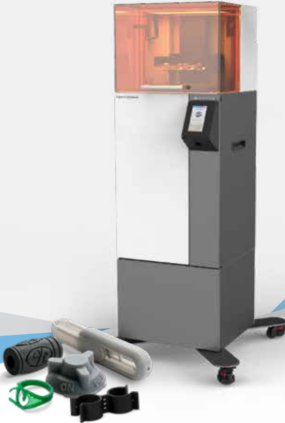
Figure 4 ® Standalone

Ultra-fast and affordable industrial 3D printer