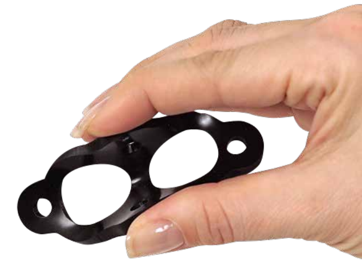
FabPro Elastic BLK is a material suited for the prototyping and design of a wide variety of elastomeric parts.

FabPro Elastic BLK material expands the range of functional materials for 3D Systems' most affordable industrial 3D printer, the FabPro 1000. Rugged and durable, the FabPro 1000 is designed for engineers and designers who want to save time and money by managing their design and prototyping processes in-house. Design iteration is quick and easy with results within hours, not days that can occur with costly outsourcing to a third-party.