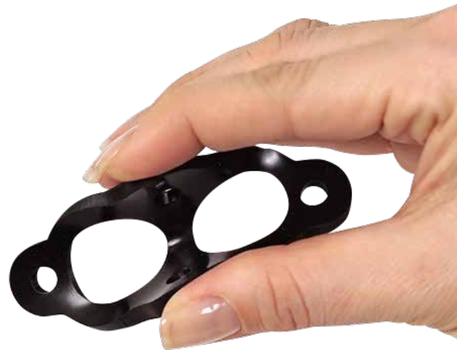
FabPro Elastic BLK is a material suited for the prototyping and design of a wide variety of elastomeric parts.

FabPro Elastic BLK material expands the range of functional materials for 3D Systems' most affordable industrial 3D printer, the FabPro 1000. Rugged and durable, the FabPro 1000 is designed for engineers and designers who want to save time and money by managing their design and prototyping processes in-house. Design iteration is quick and easy with results within hours, not days that can occur with costly outsourcing to a third-party.