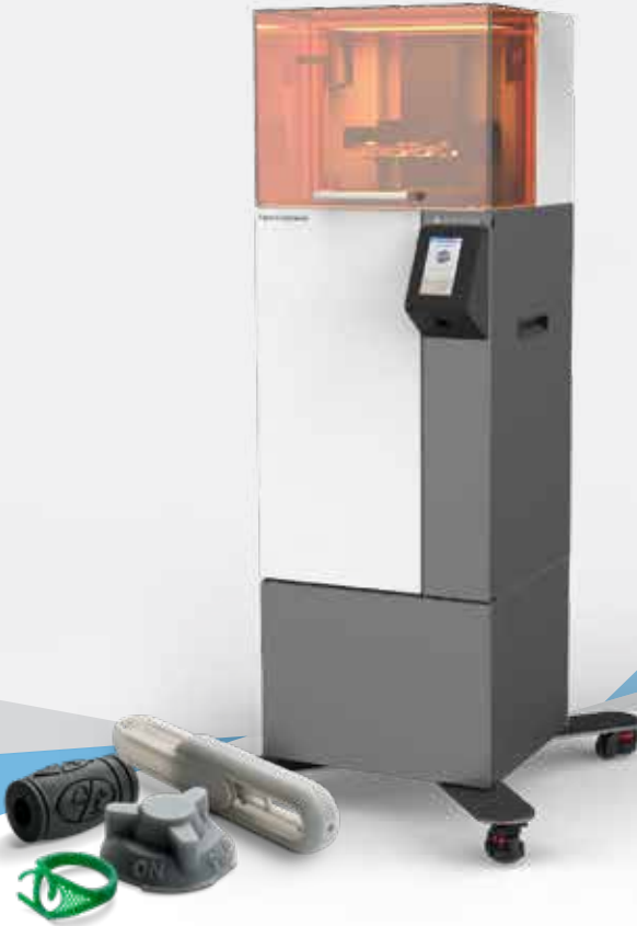
Figure 4 ® Standalone

Ultra-fast and affordable industrial 3D printer