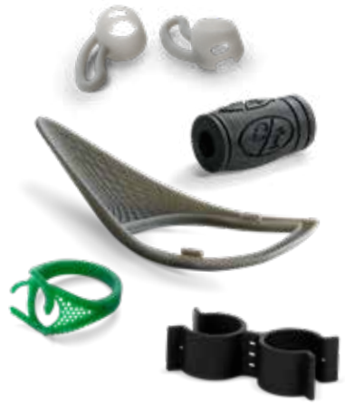
Figure 4™ TOUGH-GRY 10

Create parts that combine high resolution with exceptional surface quality and mechanical properties from a variety of robust materials. Materials available for Figure 4 Standalone include a broad and expanding range of industrial materials, including cast and elastomeric materials. Quick and easy material changeover allows for functional prototyping and production application versatility with the same printer.