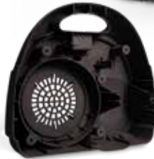
Back cover of vacuum cleaner printed in DuraForm EX Black