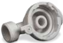
Hose fitting printed in DuraForm ProX GF