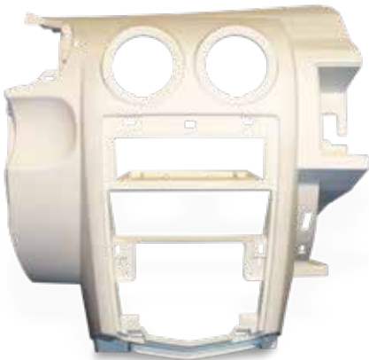
DuraForm PA Dashboard