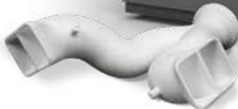
Manifold printed in DuraForm ProX FR1200