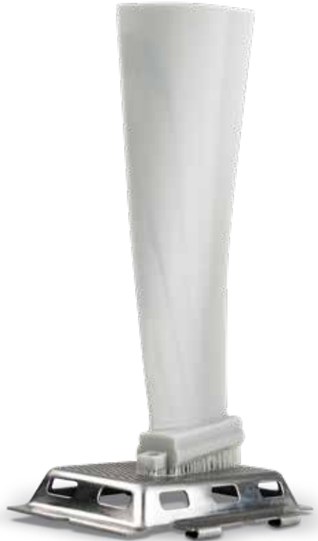
Produce parts up to 346 mm high with Figure 4 Modular

Figure 4 solutions allow manufacturing capacity to grow alongside demand—from a standalone printer for rapid prototyping to modular mid-volume direct production systems that grow as your volume grows, up to a fully-automated, fully-integrated production platform for a complete factory solution.