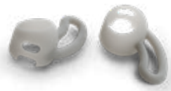
Customized ear buds in Figure 4 TOUGH-GRY 15