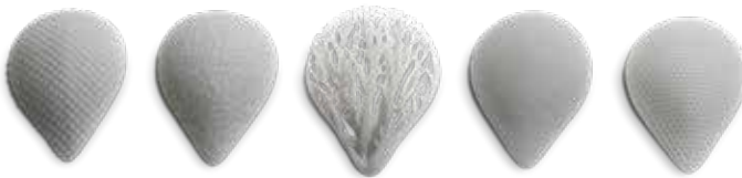
Digital texturing printed with Figure 4 technology in Figure 4 TOUGH-GRY 15

NOTE: Not all products and materials are available in all countries – please consult your local sales representative for availability