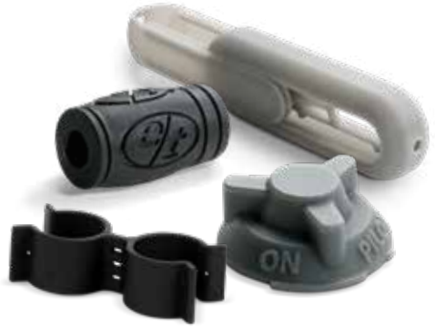
Figure 4 MED-AMB 10*

Rigid ABS-like black material for production applications