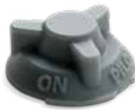
Re-manufacturing of legacy pilot knob in Figure 4 TOUGH-GRY 10