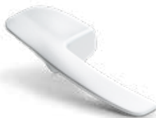
Painted automotive door handle in Figure 4 TOUGH-GRY 15