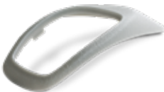
Textured gear shift cover in Figure 4 TOUGH-GRY 10