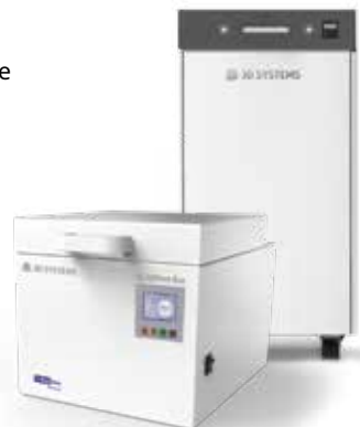
LC-3DPrint Box UV Post-Curing Unit