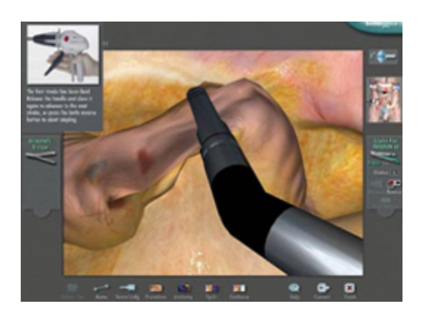
Simbionix Sigmoidectomy Module Provides a simulated Echelon Flex for additional practice.