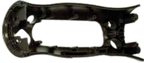
Accura ABS Black

The wide range of Accura engineered materials offers the toughest and the highest quality parts to meet a broad range of commercial and production applications.