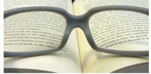
Accura Xtreme (frame) and Accura ClearVue (lenses)