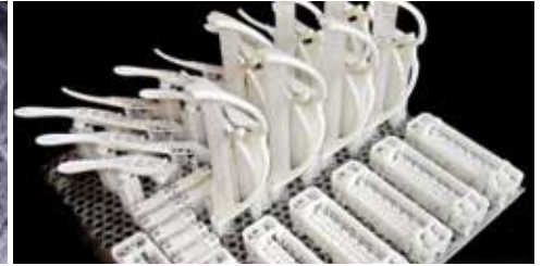
Accura Xtreme White 200