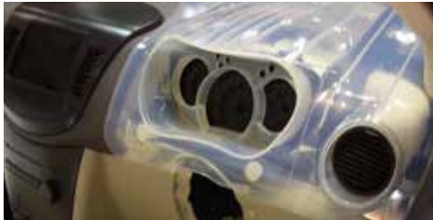
Various Accura materials for form and fit tests of a dashboard

Plastic and composite parts made from Accura SLA materials are the industry's gold standard for accuracy, providing excellent resolution, surface finish and dimensional tolerances. Accura SLA materials offer the broadest choice of materials in 3D printing and can easily be optimized for specific prototyping, casting, tooling and direct manufacturing applications.