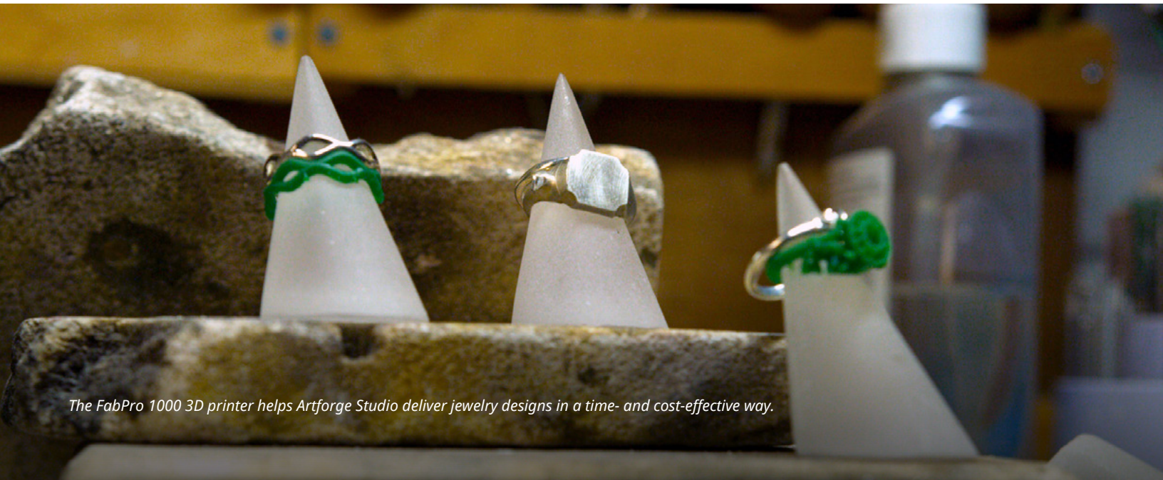
The FabPro 1000 3D printer helps Artforge Studio deliver jewelry designs in a time- and cost-effective way.