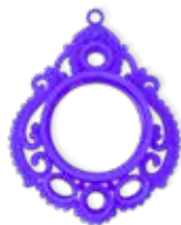
Visijet M3 CAST