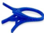
Visijet M3 Hi-Cast

Print sharp edges, extreme crisp details and smooth surfaces with high fidelity. ProJet MJP wax printers are ideal for intricate precision jewelry pieces manufacturing with reduced metal hand polishing.