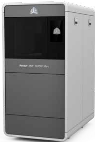
ProJet MJP 3600W Series high-capacity, high throughput precision wax pattern 3D printer