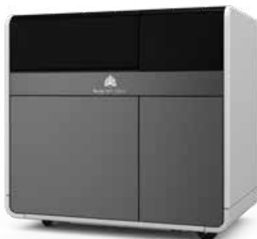
ProJet MJP 2500W fast and affordable precision wax patterns 3D printer

A build area of up to 4.7 times larger than similar class printers allows for broader application coverage and extended unattended operation. ProJet MJP wax printers' high productivity means fast amortization and high return on investment.