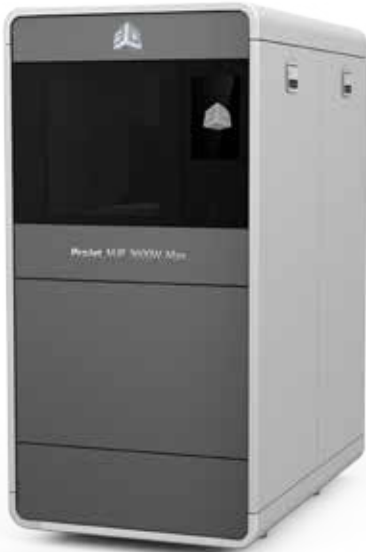
Projet MJP 3600W Series high-capacity, high throughput precision wax pattern 3D printer

Print sharp edges, extreme crisp details and smooth surfaces with high fidelity, ideal for intricate precision metal parts manufacturing with reduced metal hand polishing.