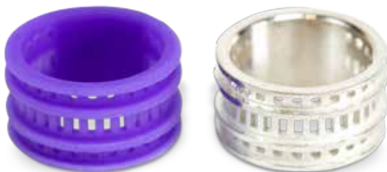
Ring printed in Visijet M2 CAST and cast

Warranty/Disclaimer: The performance characteristics of these products may vary according to product application, operating conditions, material combined with, or with end use. 3D Systems makes no warranties of any type, express or implied, including, but not limited to, the warranties of merchantability or fitness for a particular use.