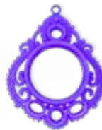
Visijet M3 CAST