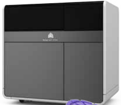
Projet MJP 2500W fast and affordable precision wax patterns 3D printer

With 3.7X or more larger build volume capability than similar class printers for broader applications versatility and 24/7 operation, Projet MJP wax printers' high productivity means fast amortization and high return on investment.