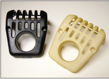
Muffler Guard with Concept Model Printed with ZPrinter 310 Plus