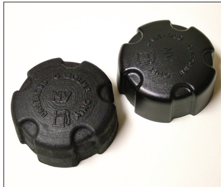
Fuel Tank Cap and Prototype Printed with ZPrinter 310 Plus

Aesthetics isn't just for fine art anymore. Consumers care deeply how their products look, even utilitarian ones like Powermate Corp.'s gas-powered air compressors, pressure washers, generators and backup power systems. Plain old rectilinear sheet metal has given way to sleek injection-molded plastic parts in these products, not only for function but for improved shelf appeal.